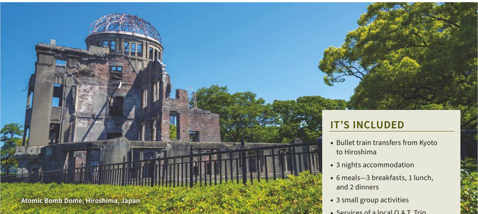
Atomic Bomb Dome, Hiroshima, Japan