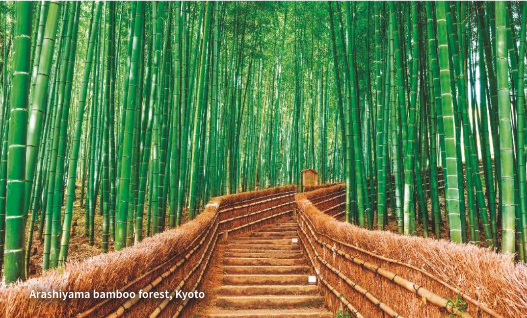
Arashiyama bamboo forest, Kyoto