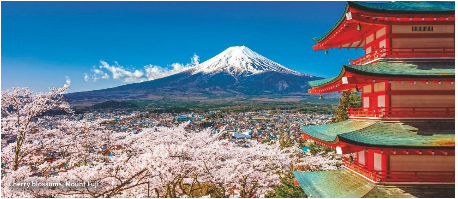
Cherry blossoms, Mount Fuji