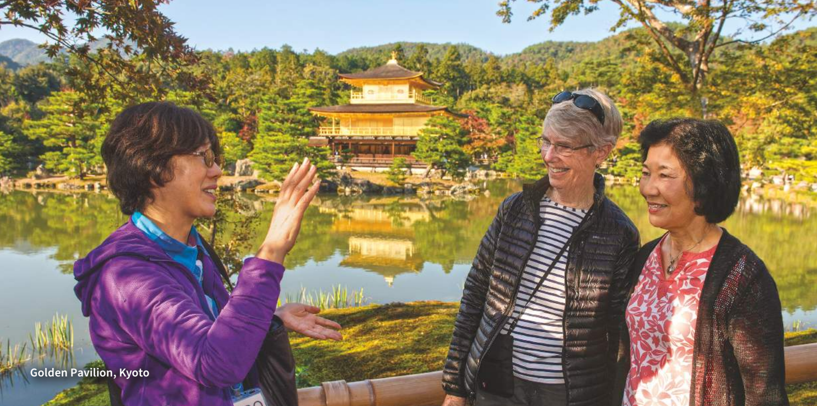
Golden Pavilion, Kyoto