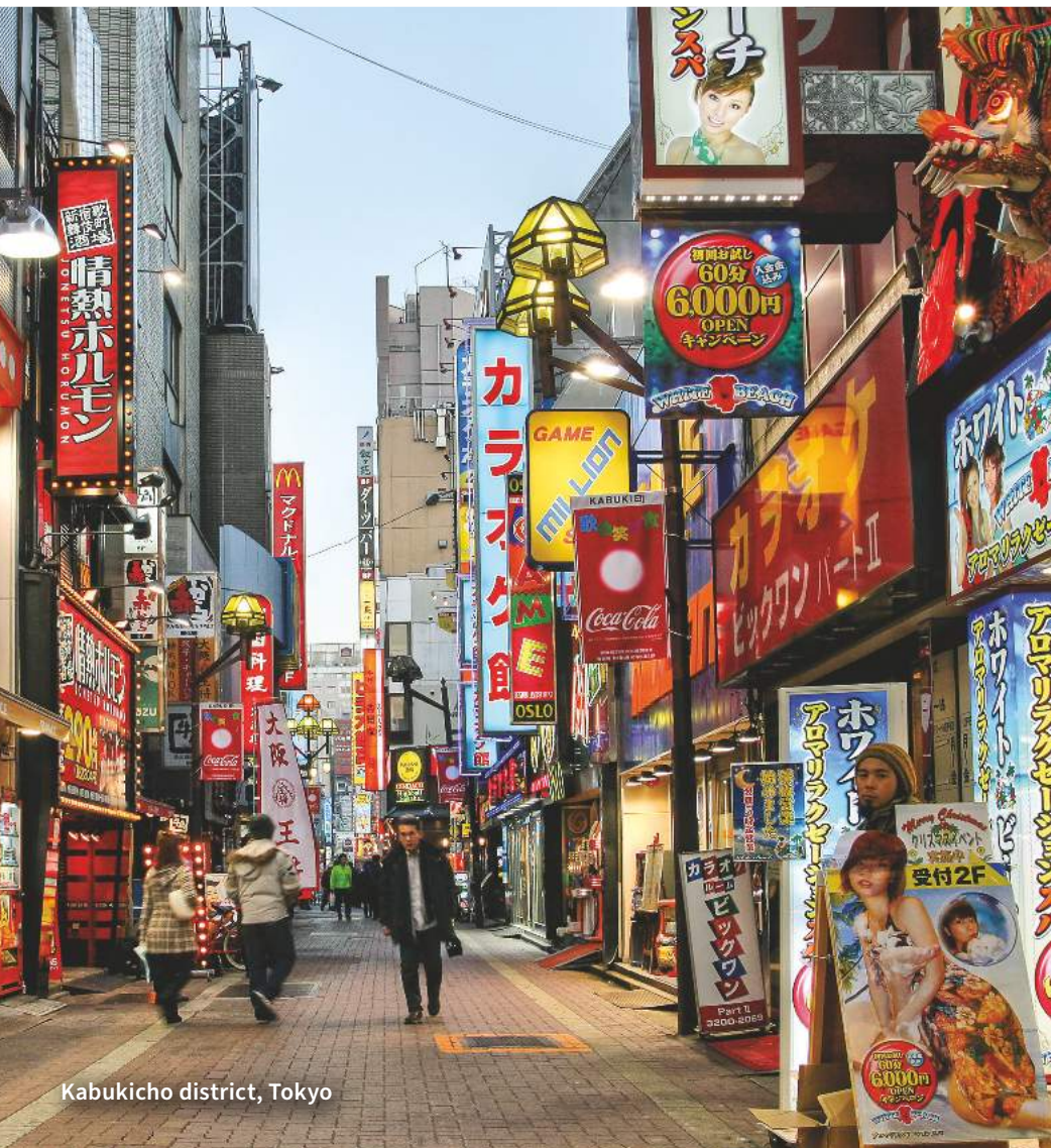
Kabukicho district, Tokyo

We'll drive to Tokyo, where we'll ride the shinkansen (bullet train) to Kanazawa. At 200 mph, it remains among the fastest trains in the world.